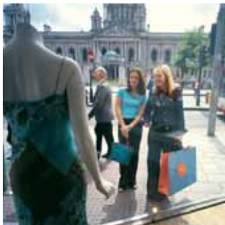
City Centre shopping