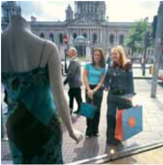
City Centre shopping