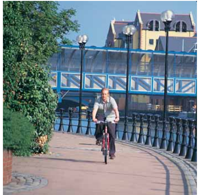
Cycling by the Lagan River

"This is the best conference – where else to hear all the good things happening with harm reduction."