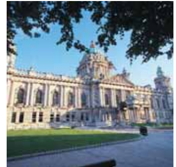
Belfast City Hall