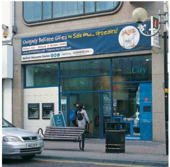
The Belfast Welcome Centre

“Harm reduction has worked regardless of cultural and economic differences between regions, in areas as diverse as the USA, Sweden, Hong Kong, Australia and Thailand.”