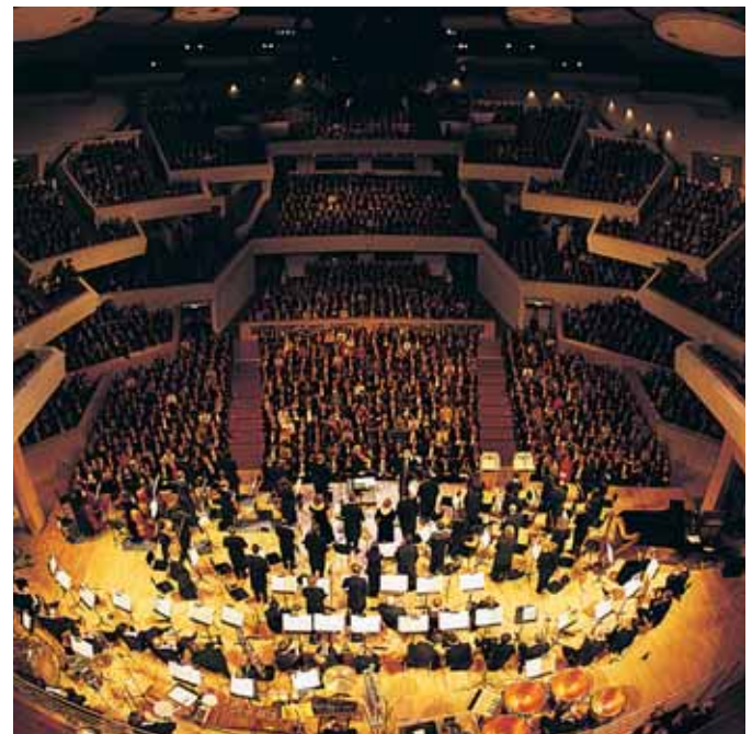
The Ulster Orchestra perform in the Waterfront Hall