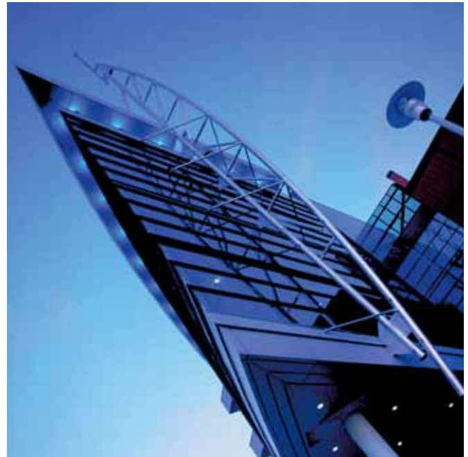
The Point, W5

RESPONDING TO HIV/AIDS IN THE ASIA/PACIFIC REGION